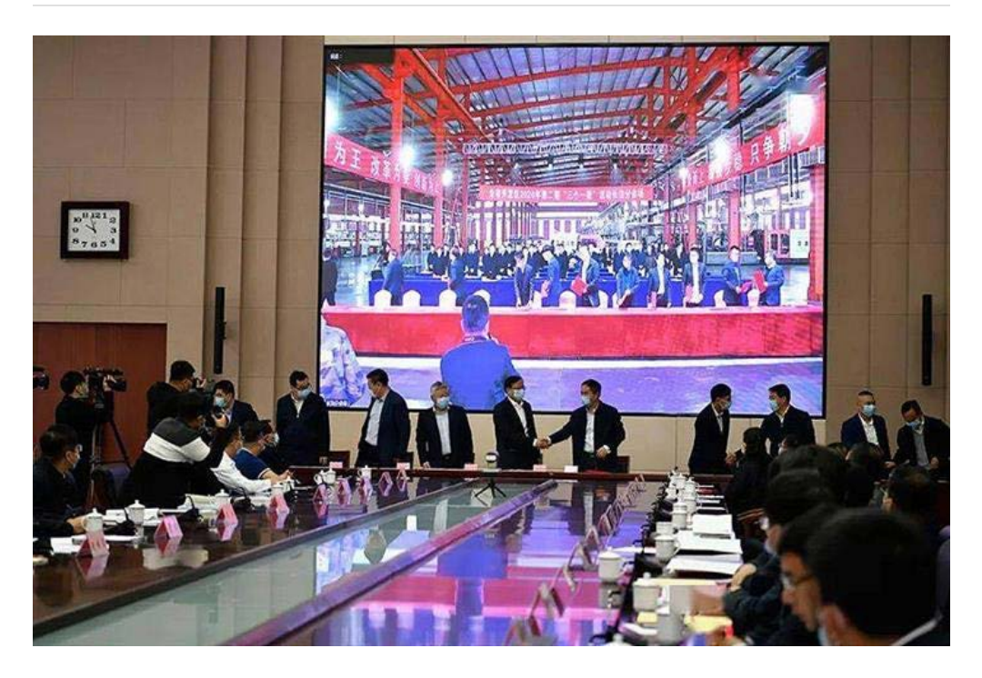
Cathay Biotech to Invest USD596.5 Million in Northwest China's Largest Synthetic Biology Project